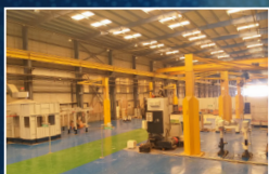
Al Jubail, Saudi Arabia